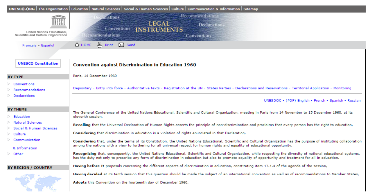
Convention against Discrimination in Education 1960 accessed 17 September 2023

and the U.N. Convention against Discrimination in Education, to which Sweden is a signatory.